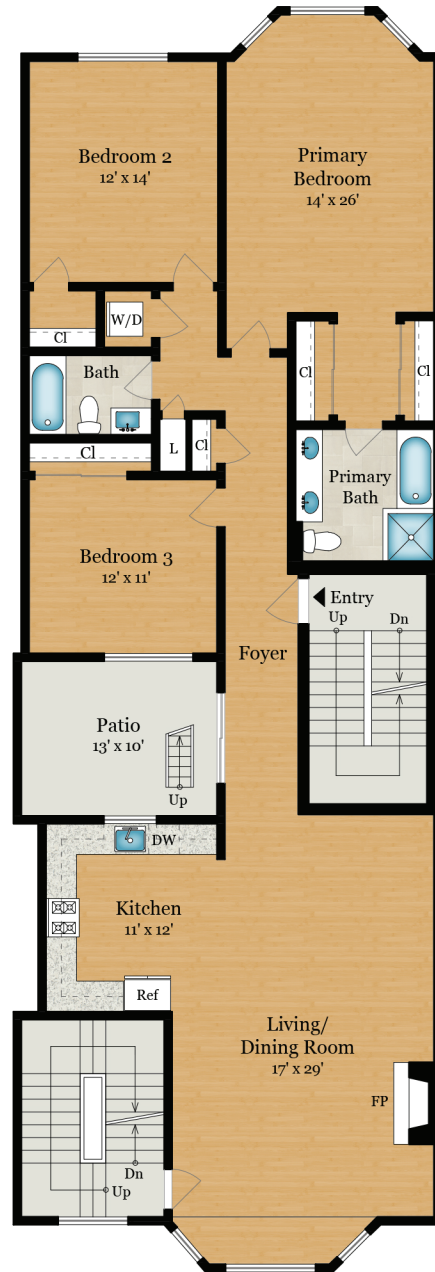
MAIN LEVEL 1,735 SQ FT