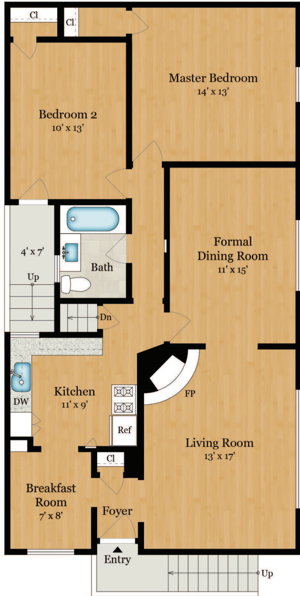
MAIN LEVEL 1,125 SQ FT