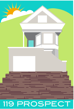
BERNAL HEIGHTS SINGLE FAMILY VIEW HOME