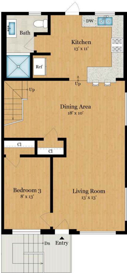
SECOND FLOOR 850 SQ FT