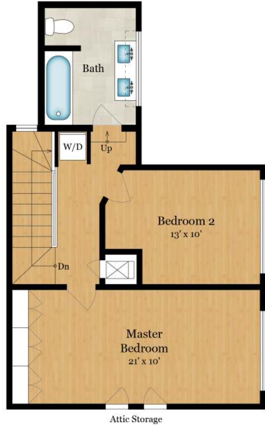
THIRD FLOOR 585 SQ FT