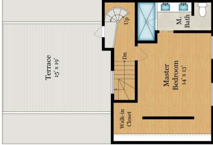
UPPER LEVEL 445 SQ FT