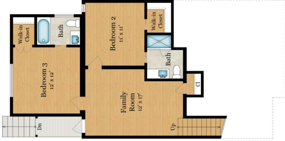
LOWER LEVEL 705 SQ FT

Rendering by Floor Plan Visuals. All measurements are approximate. While deemed reliable, no information on these floor plans should be relied upon without independent verification.