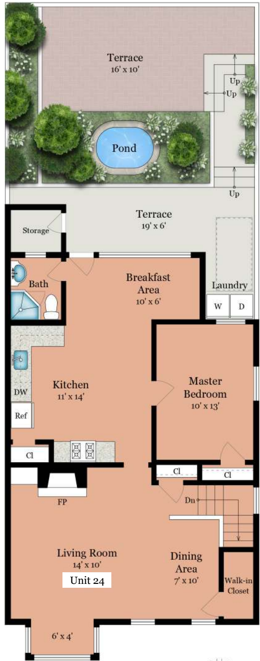
SECOND FLOOR Unit 24 905 SQ FT Common Storage 30 SQ FT