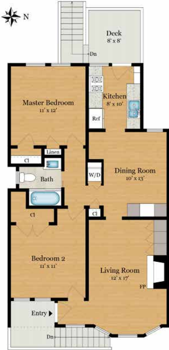
MAIN LEVEL 910 SQ FT

* Estimated Total Finished & Unfinished Square Footage: 1,840 SQ FT